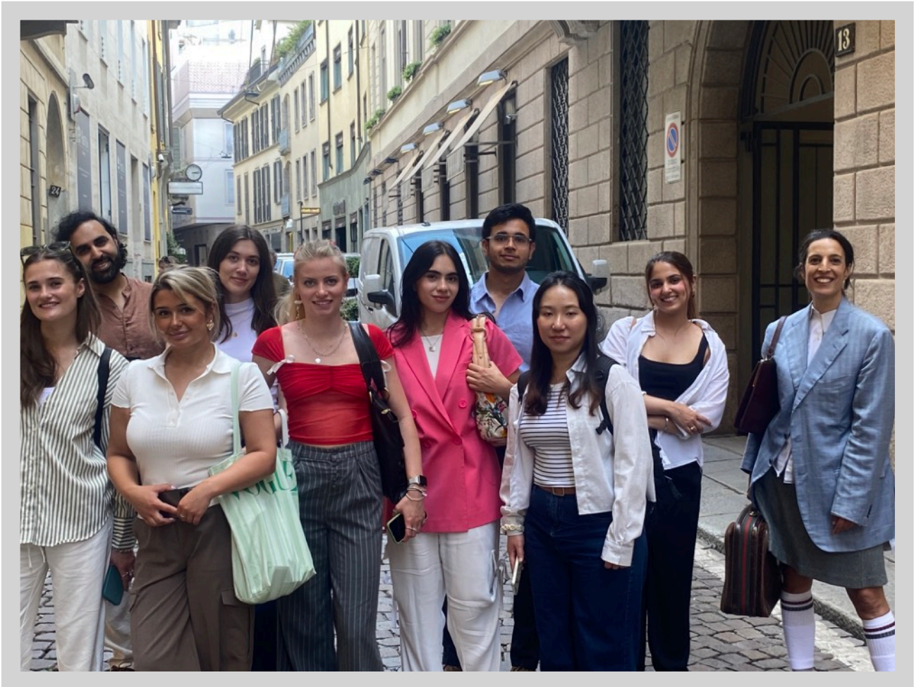
Milan, Summer School July '24

The program is ideal for early stage professionals from a wide range of relevant disciplines -business, law, Art, creative industries, etc.-, Master and Bachelor-level graduates with some or little fashion experience and who are highly motivated to work in the fashion industry.